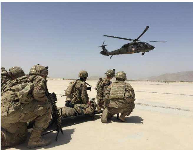
Ssg McMaster, SPC Castaneda, and SPC Carter conducting MEDEVAC 102 training with 3-126 GSAB