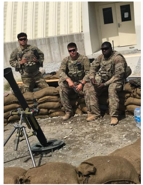
Images above, from left to right: Members of the staff receive coins from WH6 Members of the mortar platoon receive certificates of appreciation and AAMs from WH6 Members of the mortar platoon on mission