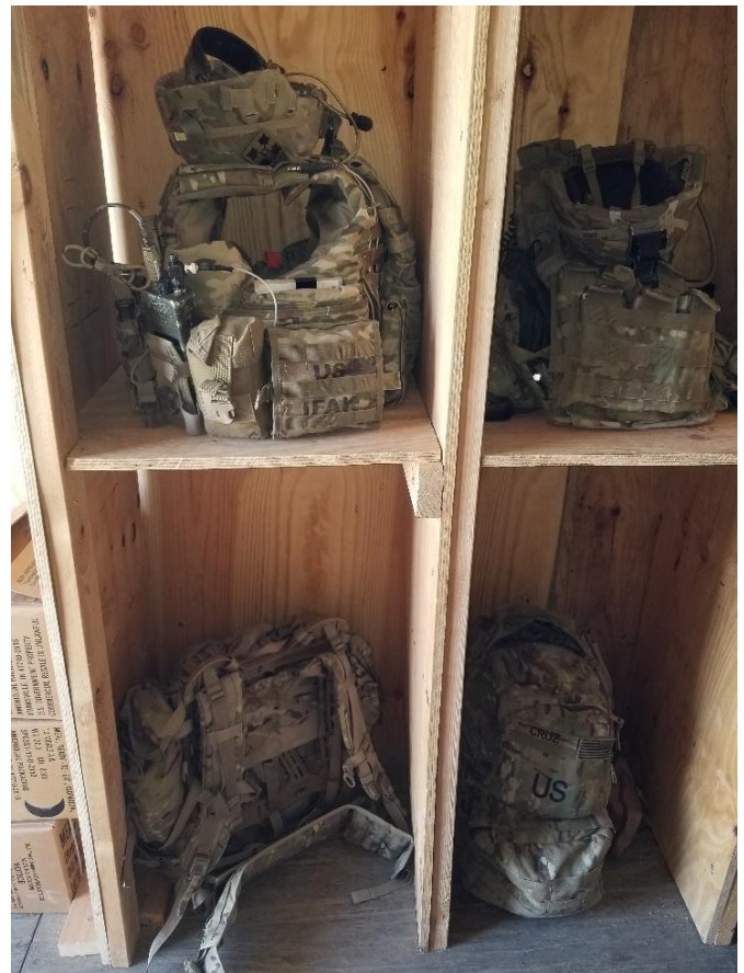
1st, 2nd, 3rd, and HQs are utilizing the ready connexes they designed and built.