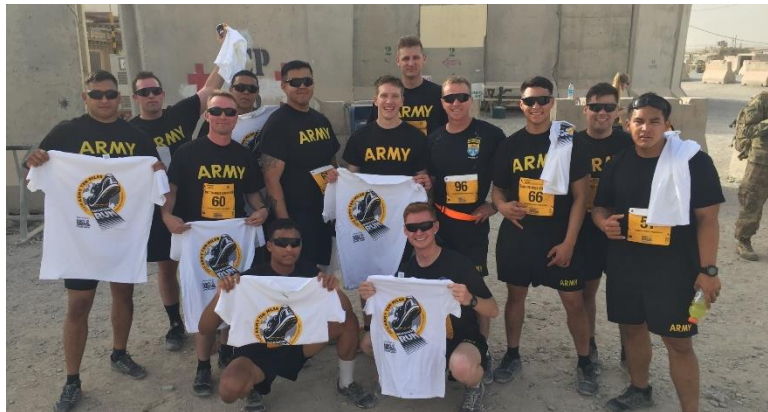
Team Apache completing the Kandahar Airfield Army Ten Miler Shadow run