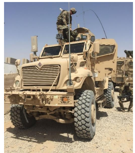
SGT Trapp conducts Preventative Maintenance on a QRF truck after a mounted patrol.