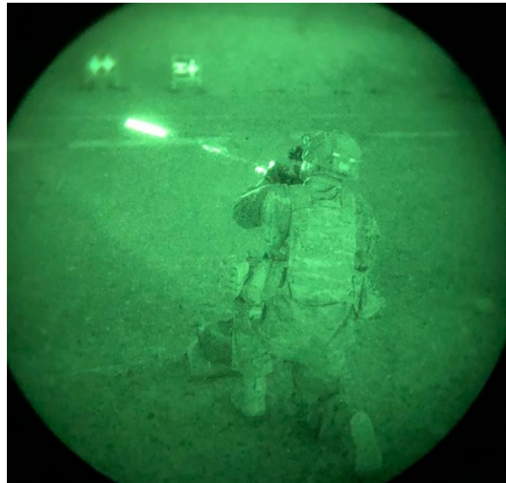
Lethal Apache Warriors conducting night Advanced Rifle Marksmanship