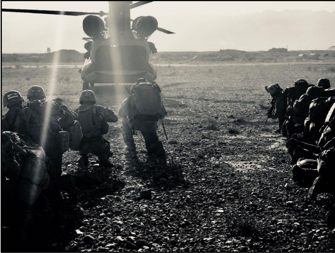
Chosen conducts Helicopter Assault Force training