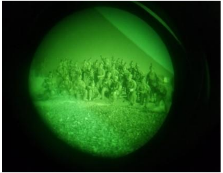
1st Platoon posed for a photo prior to executing missions in support of Resolute Support and TAAC-S in southern Afghanistan.