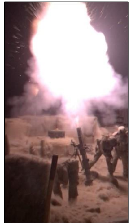
Lethal Battalion and Baker Company mortars fire the 120 mm mortar while supporting the SFAB and Afghan National Army in southern Afghanistan.