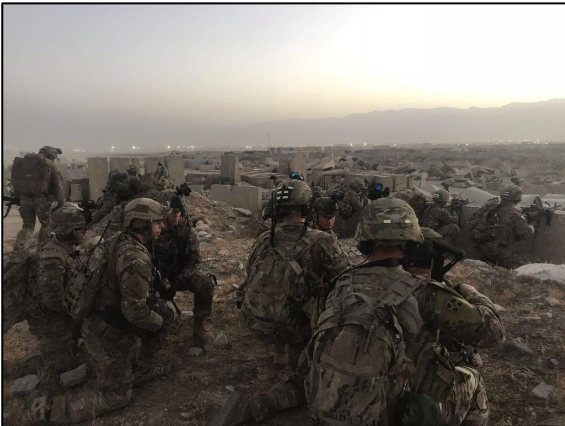
Chosen Soldiers conduct training during their platoon RIP