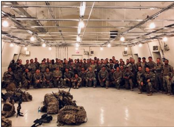
3 rd Platoon stopped for a photo with SFAB CAT 1230 prior to INFIL for an important mission here in southern Afghanistan.