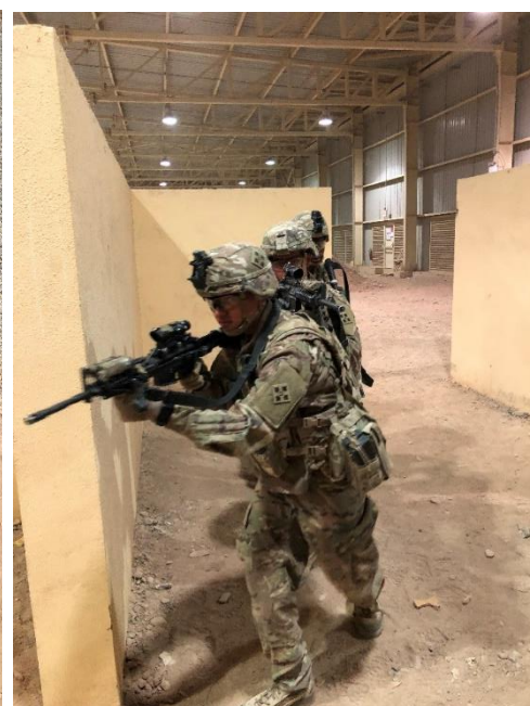
Soldiers from 3 rd platoon Apache Company rehearsing their room clearing battle drills at Kandahar Airfield.