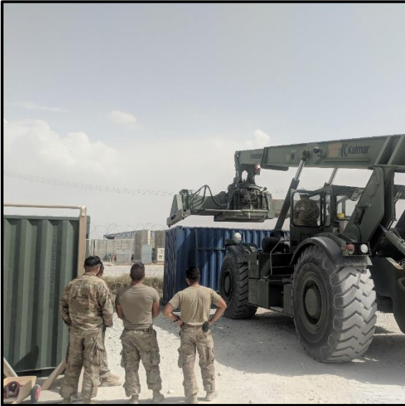
Soldiers from Hazard watch a demonstration on how to lock in and out of a container while using the RTCH