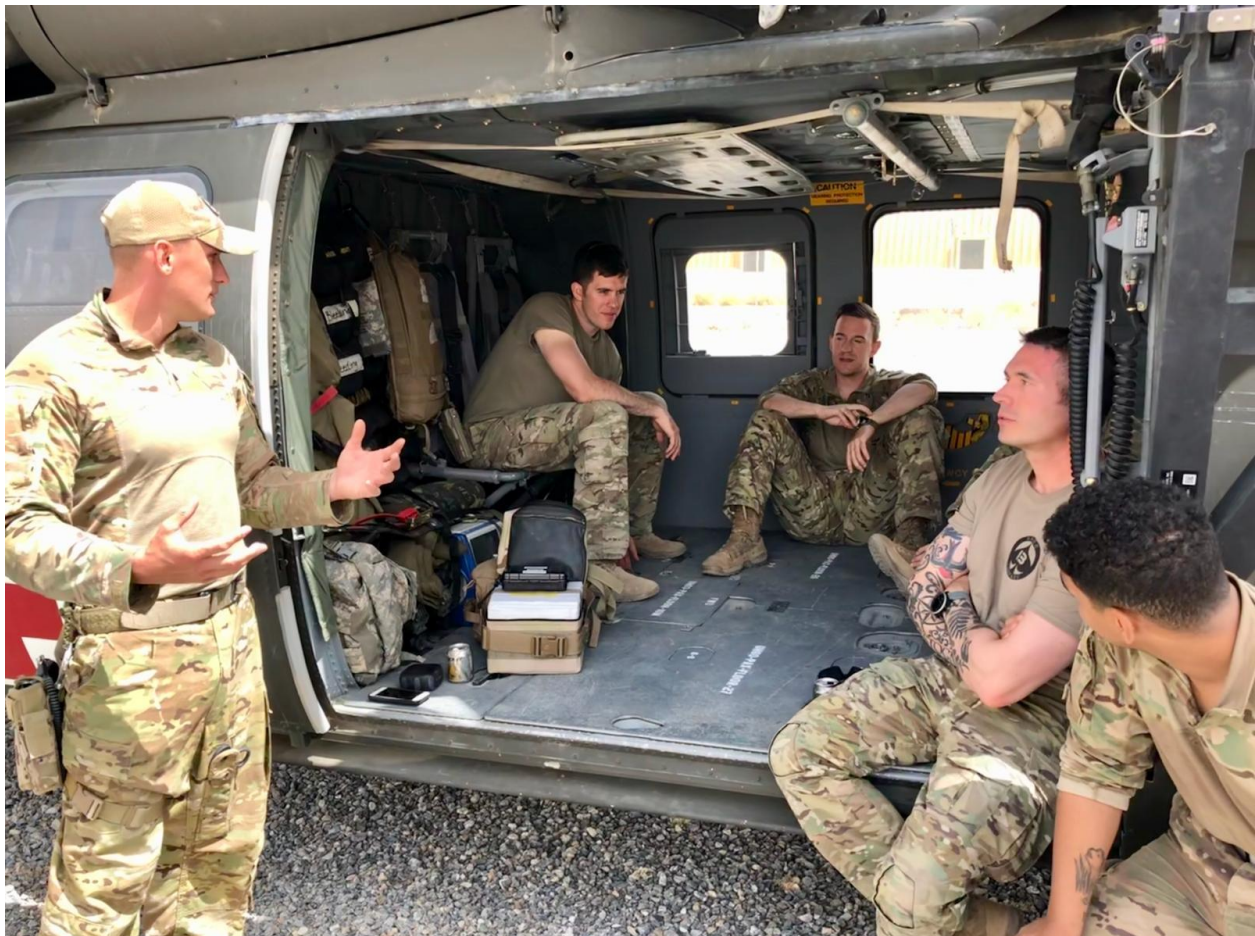
Soldiers from the medical platoon conducting training with TF Panther flight medics on mission