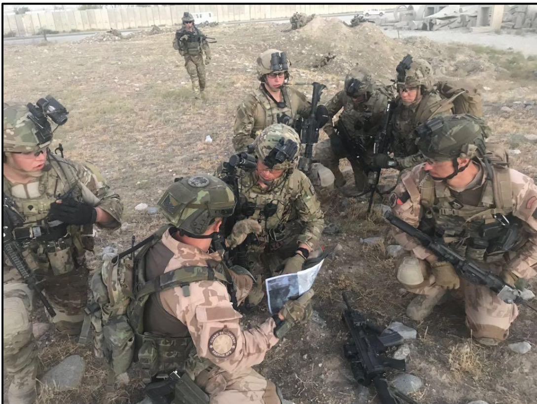
Chosen Soldiers conduct training with the Czech military