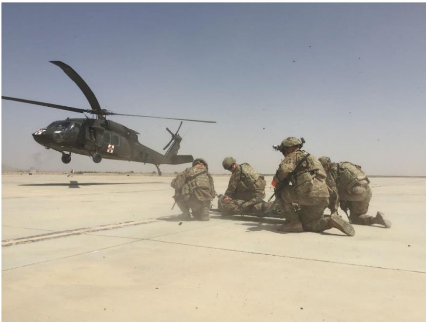
Soldiers from Apache Company working hand in hand with 3-126 GSAB during MEDEVAC 102 training, ensuring the team is always ready to treat any casualty anywhere on the battlefield.